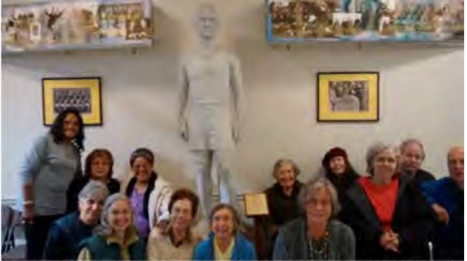
BYM Indian Affairs Committee members, other Friends, guides, and guests with Jim Thorpe Statue at Carlisle Barracks Fitness Center, Carlisle, PA.