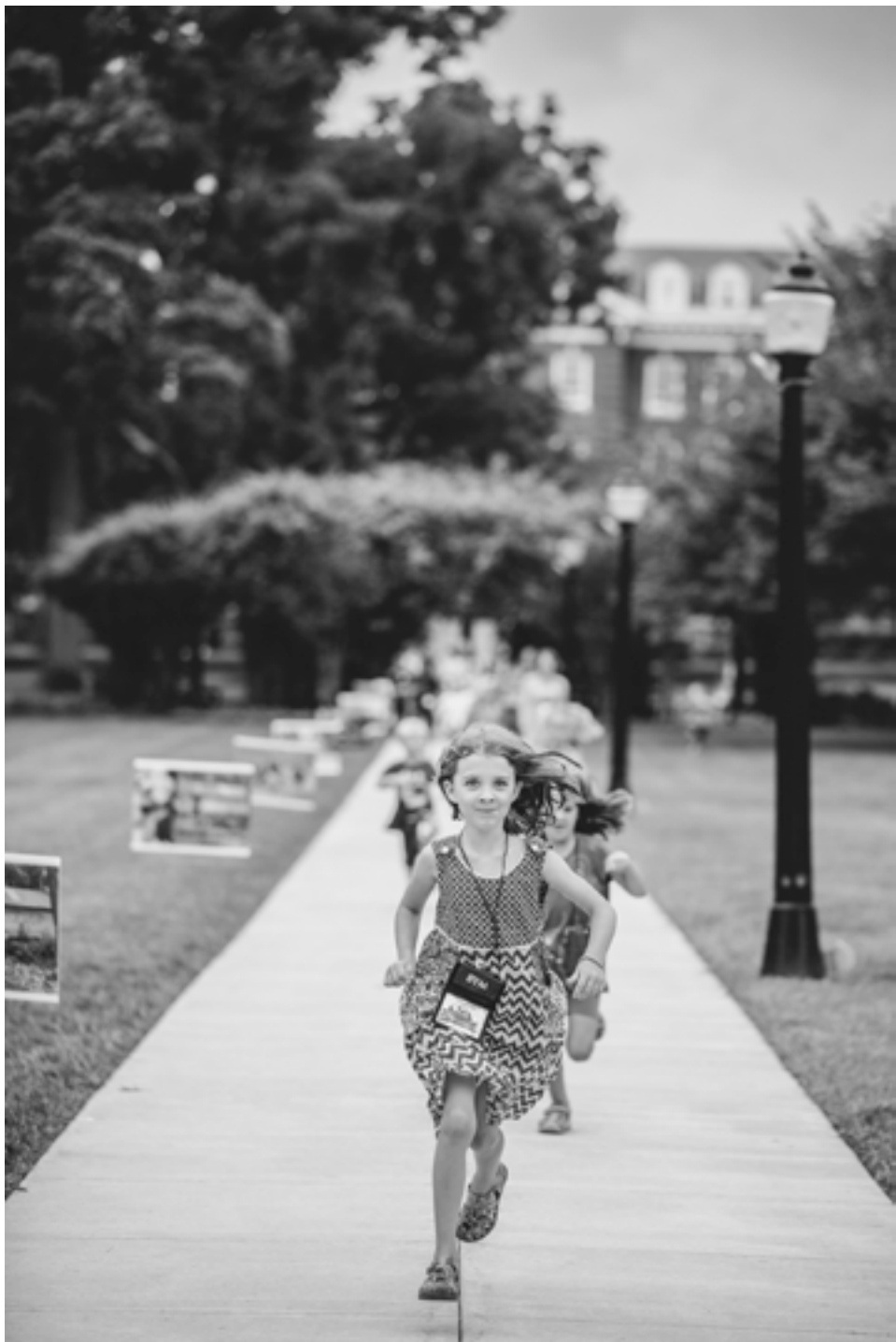
Annual Session 2016