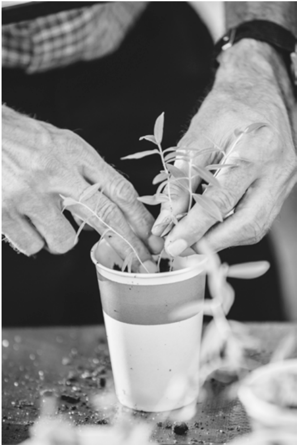
Annual Session 2016