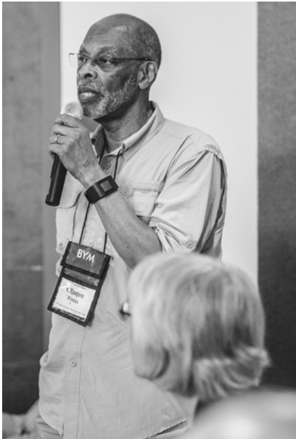
Annual Session 2016