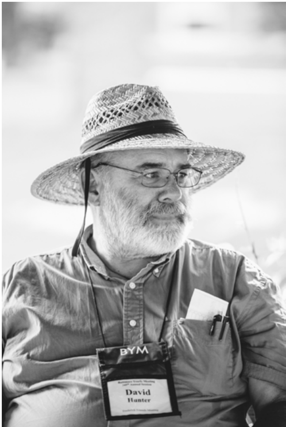
Annual Session 2016