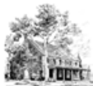
The Sandy Spring Friends Meeting House

SANDY SPRING MONTHLY MEETING OF THE RELIGIOUS SOCIETY OF FRIENDS 17715 MEETING HOUSE ROAD SANDY SPRING, MARYLAND 20860 301-774-0792 e-mail: office@sandy-spring.org web site: www.sandy-spring.org