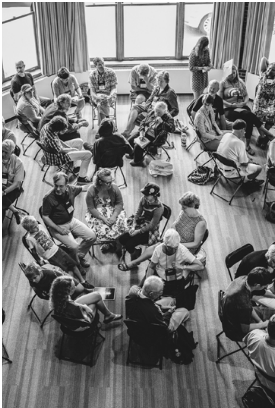
Annual Session 2016