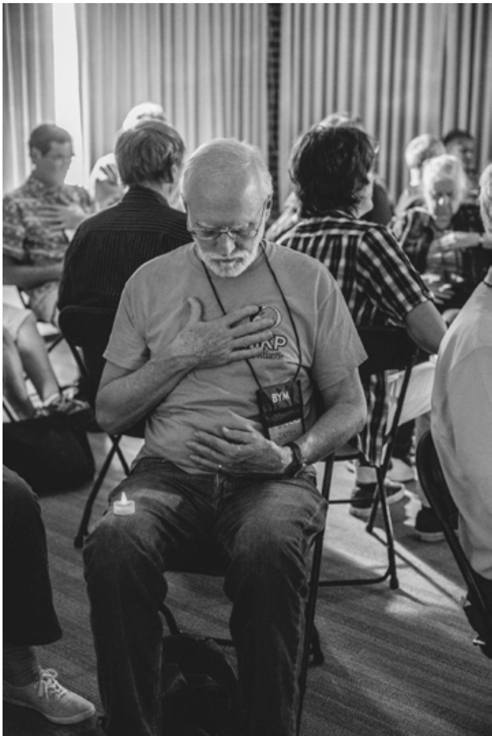
Annual Session 2016